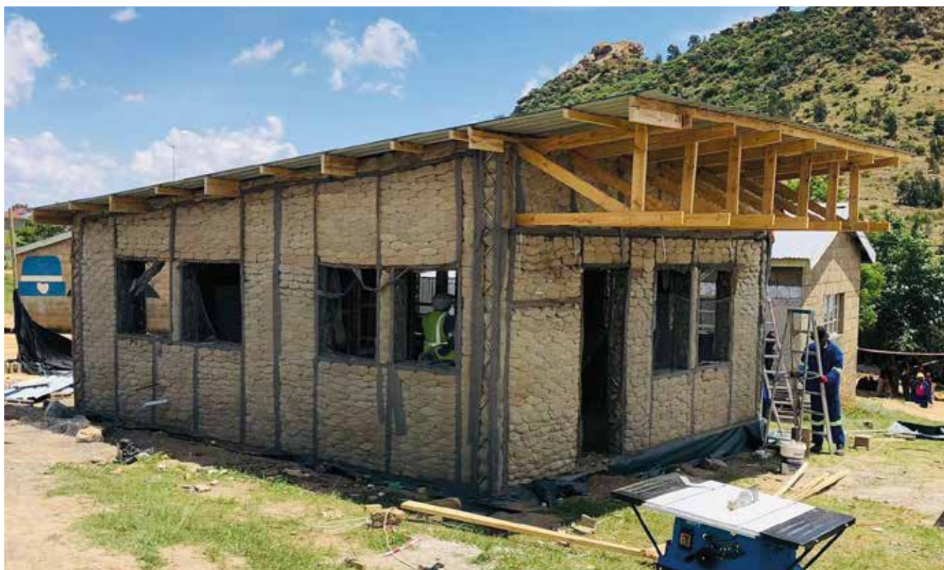
Sandbag technology used on Seboka Kitchen 2022

This year, we're constructing a kitchen at Makoanyane Primary School, employing the Compressed Earth Blocks method. Your assistance will support our project enhancing food security, health, and sanitation across five schools under the 5 Hub Schools Initiative.