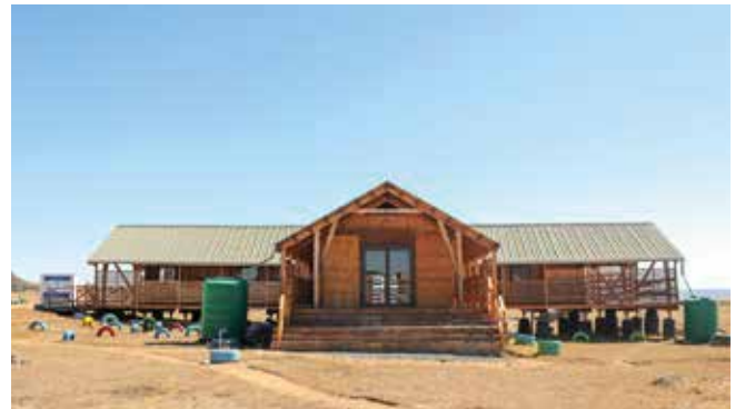
Intellectual Disability & Autism Lesotho (IDAL) Centre - 2019