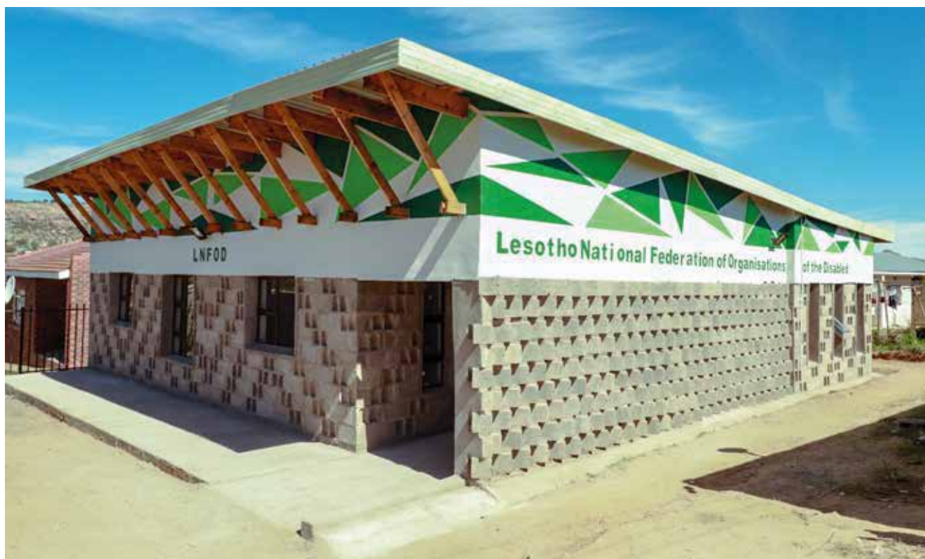
LNFOD Headquarters - in loco project 2020

We aim to bridge the disconnect between tradespeople and professionals, bringing them together through a program called in loco ; a “learning by doing” fellowship programme in Lesotho that uses locally sourced talent and materials, striving to create an entrepreneurial mindset.