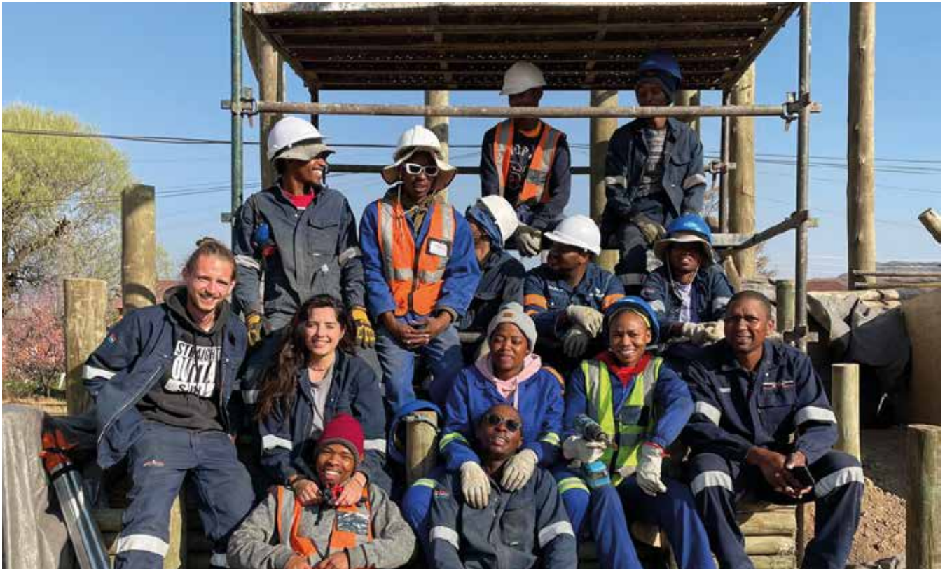
International Students with Fellows on site, 2023

Most people will require a visa for entry to Lesotho, however for most nationalities these can