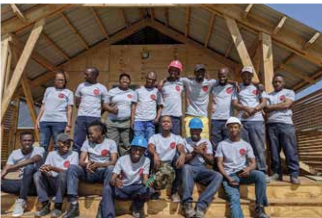
Second cohort of in loco fellows-2019

participatory process engaging international cohorts of students and the local community. in loco offers a real knowledge exchange experience for all involved. Through this program, we essentially collaborate with local vulnerable communities to build desperately needed infrastructure utilizing local graduates from the fields of Design, Architecture, and the Built Environment. This way there are 3 outcomes: the graduates learn vital entrepreneurship skills while gaining practical work experience; vulnerable communities are provided with the infrastructure they need; and there is a reduction in the unemployment rate in Lesotho as on average 1 fellow creates employment for 5 other people within 3 months of completing the fellowship.