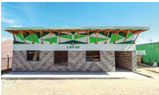
Lesotho National Federation of Organizations for the disabled (LNFOD) - 2020