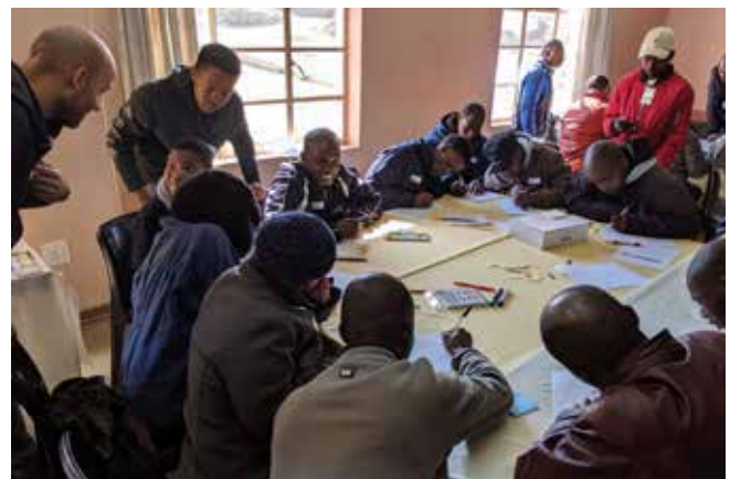
Participatory design workshop