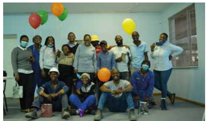
2020 in loco Cohort