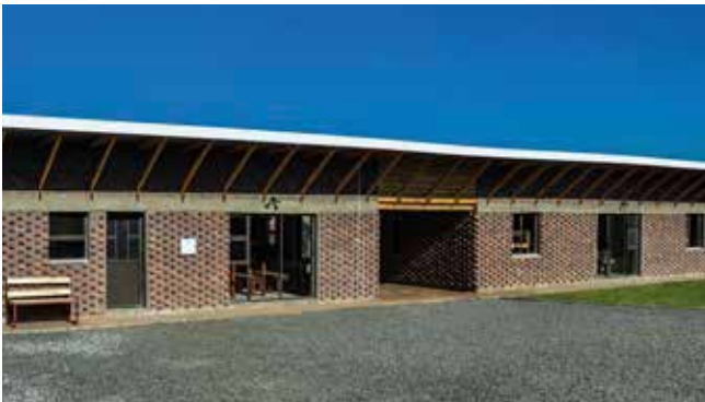
God's Love Centre (GLC) - 2018

Following the same program, we then designed and built the very first educational and sensory center for youth with intellectual disabilities for a parent-led non profit organization called Intellectual Disability & Autism Lesotho in Maseru in 2019. Followed by the design and construction of a unique inclusive building for the Lesotho National Federation of Organizations for the disabled (LNFOD) in 2020, aiming at eradicating barriers that create separation between people living with disability and those who are not. This non-profit organization can now employ people who use wheelchairs thanks to in loco .