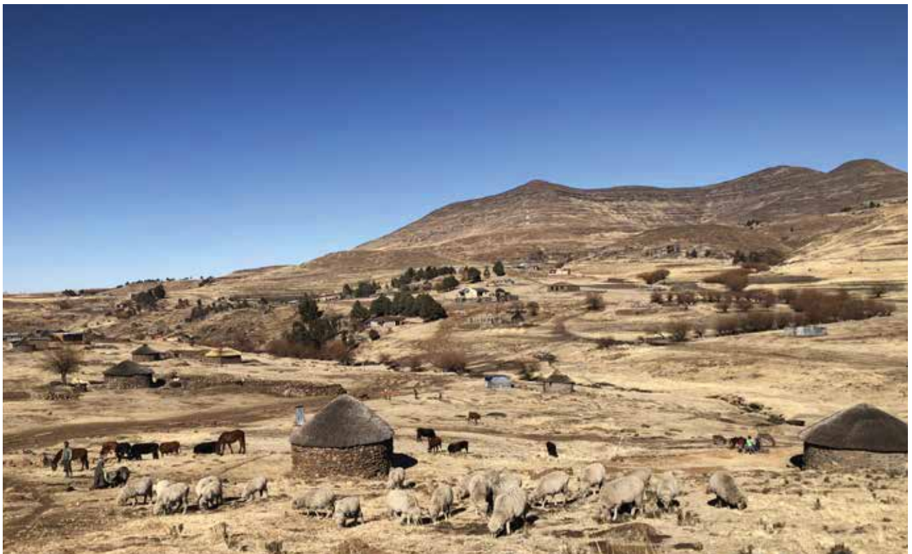
Semonkong, Maseru District