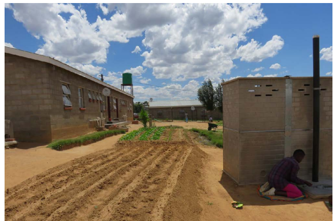
Vegetable gardens on site of the orphanage to help feed the children at minimal costs