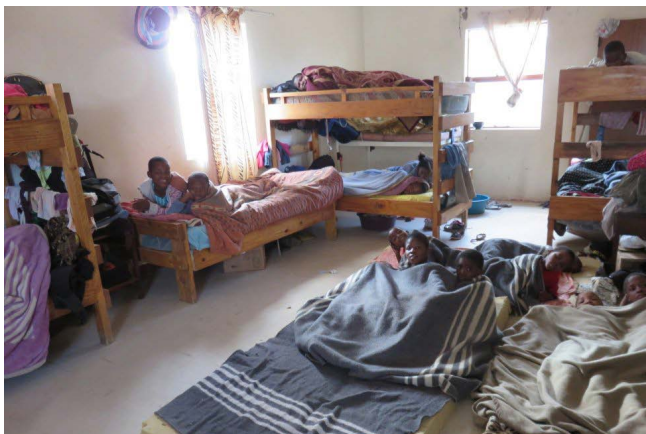
Girls' dormitory room where 26 girls sleep 3 to a mattress