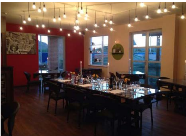
K4L Hotel & Conference Centre - No 7 restaurant

To promote sustainability of the project, and an on-going positive relationship between international experts and the local construction industry, we also partner with established local Architects, Engineers and Builders who provide further mentoring to the cohort and invaluable local insight.