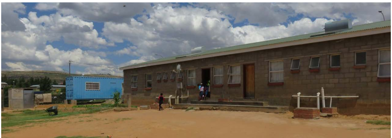
God's Love Centre - currently houses more than 54 children in just 2 dormitories with only 4 toilets and showers

Following a "hands-on, bottom-up" approach, we will be working in close collaboration with members of the local community on the completion of this building and simultaneously start the design and construction of new dormitories, facilities and external play areas. At the same time, a social entrepreneurship and mentorship training program will be run for 21 youths aged between 16 and 20 and also to the existing God's Love Centre team. This program will focus on skills needed to initiate social ventures.