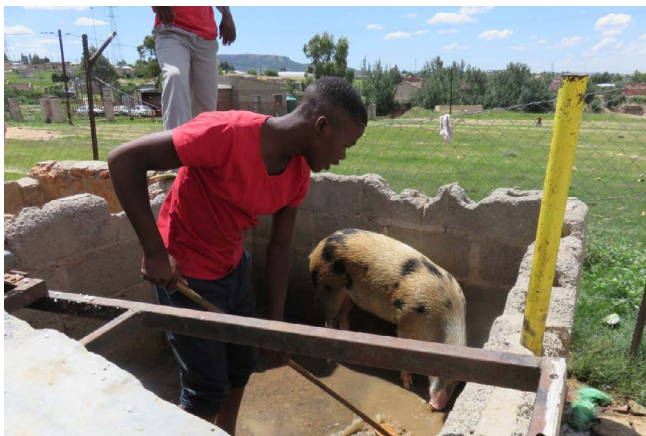
A small income generating activity of pig rearing run by the older boys at the orphanage

It is a "learning-by-doing" experience in which all participants are involved in the planning, design and building, through a participatory process engaging international cohorts of students and the local community. in loco offers a real knowledge exchange experience for all involved.