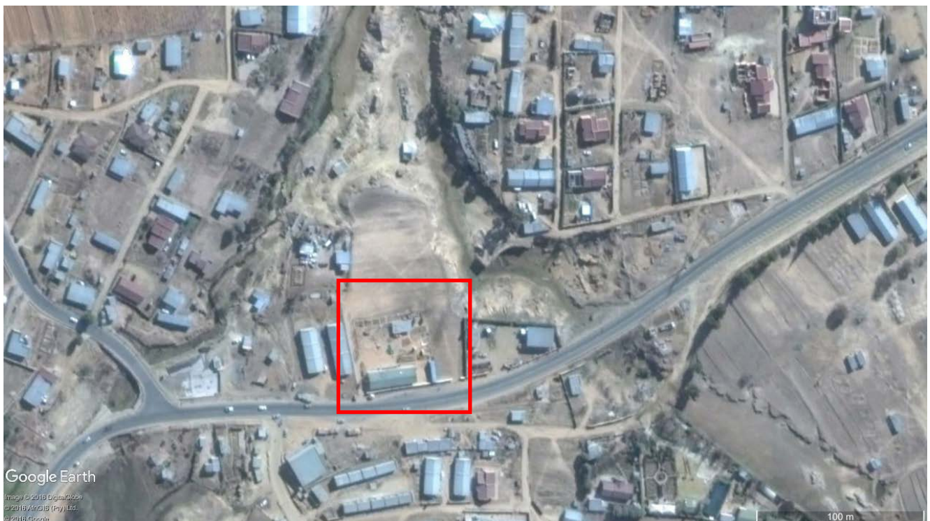
God's Love Centre aerial view

With the in loco project we plan to take our commitment to the next level and not only assist with the construction of a new dormitory block, but also provide invaluable entrepreneurship skills for all of those involved in the project.