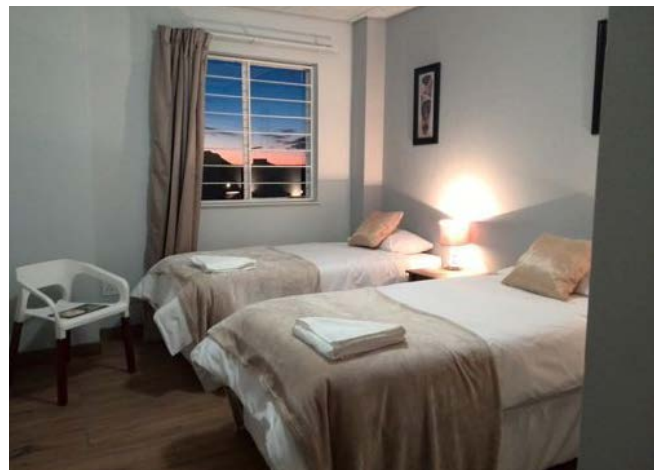
K4L Hotel & Conference Centre - twin bedroom