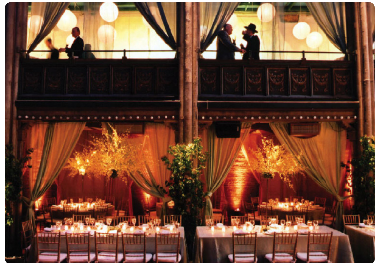
Angel Orensanz Foundation, 172 Norfolk Street, NY, NY 10002.