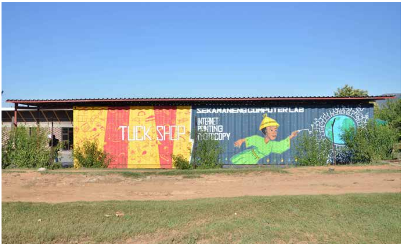
Container Conversion at GLC, in loco 2018

The concept of the hub was conceived as a result of over 20 years of cumulative work with the youth in Lesotho combined with several conversations, research and round table discussions with key stakeholders in particular with young unemployed aspiring entrepreneurs who constantly face the problem of lack of access to essential resources they need in order to launch their ideas and small businesses.