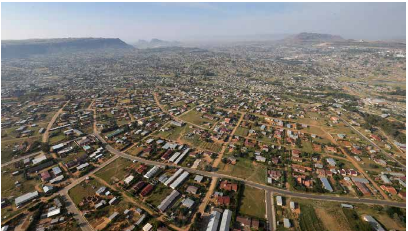
Maseru - capital city Lesotho

Additionally, rise seeks to solve the poor quality and lack of infrastructure outside of most African capital cities by bringing local skilled labour to work on architecture projects in rural areas thus improving the construction know-how within local communities. We aim to bridge the disconnect between trades people and professionals, bringing them together through a program called in loco that uses locally sourced talent and materials, striving to create an entrepreneurial mindset.