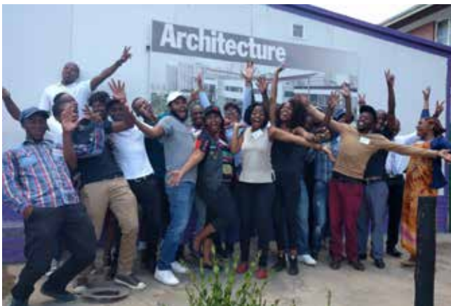
First cohort of in loco fellows

It is a "learning-by-doing" experience in which all participants are involved in the planning, design and building, through a participatory process engaging international cohorts of students and the local community. in loco offers a real knowledge exchange experience for all involved.