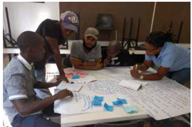
Participatory design workshop