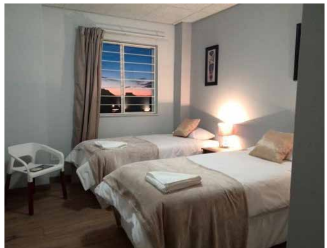
K4L Hotel & Conference Centre