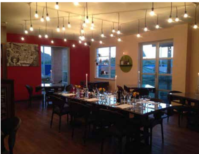
No 7 - K4L Restaurant

To promote sustainability of the project, and an on-going positive relationship between international experts and the local construction industry, we also partner with established local Architects, Engineers and Builders who provide further mentoring to the cohort and invaluable local insight.