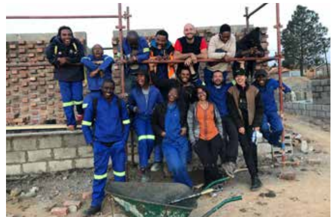
International students and fellows on site