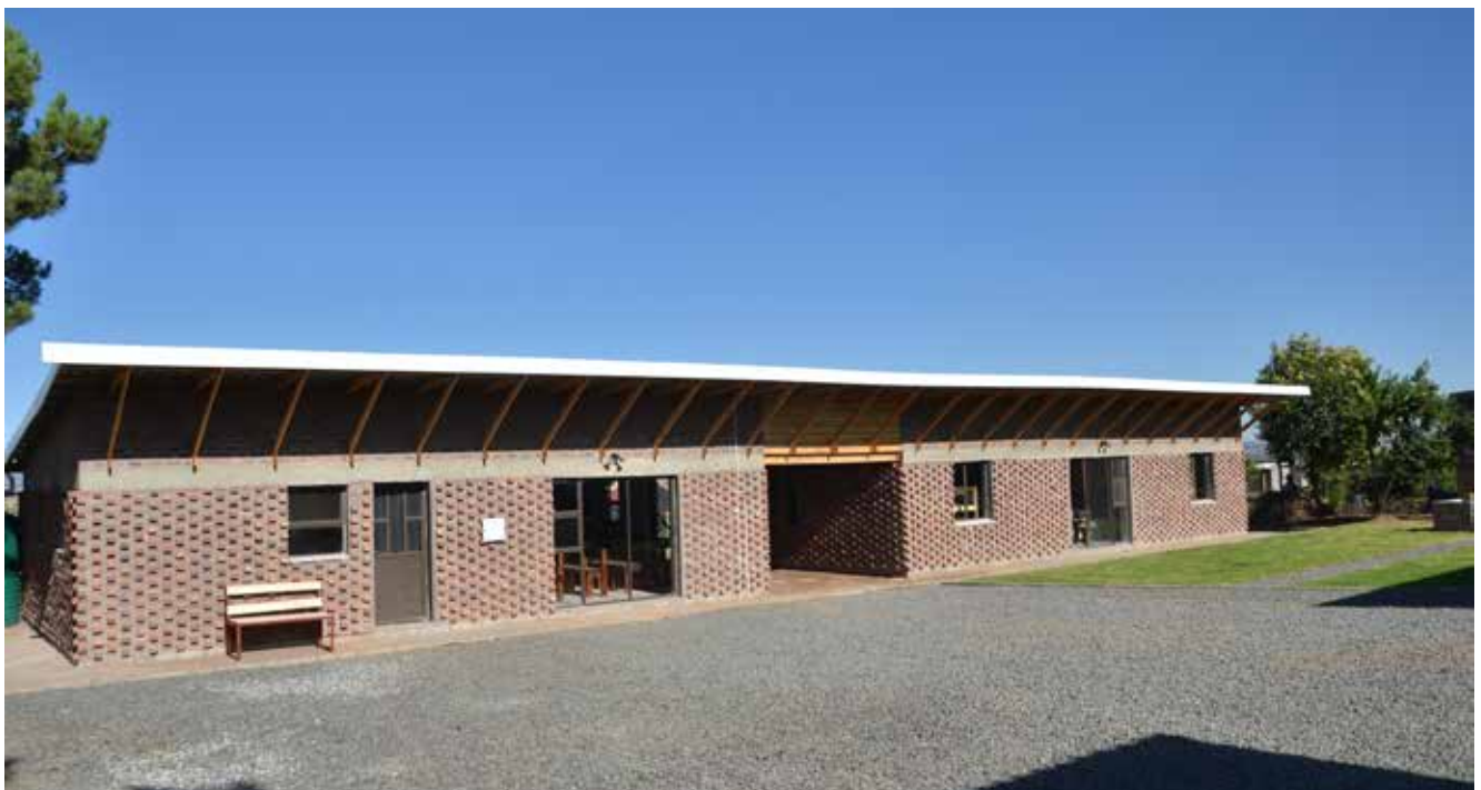
in loco 2018 - God's Love Center new orphanage

Following a "hands-on, bottom-up" approach, we worked in close collaboration with members of the local community on the completion of this building and simultaneously started the design and construction of new dormitories, facilities and external play areas. At the same time, a social entrepreneurship and mentorship training program ran for 21 youths aged between 16 and 20 and also for the existing GLC team. This program focused on skills needed to initiate social ventures.