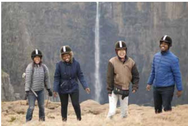
Tour visit with International students